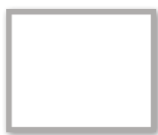
Lightweight Board AUS111