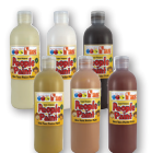
Super Tempera People Paint FN80