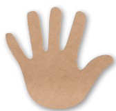
Wooden Hands CS7222